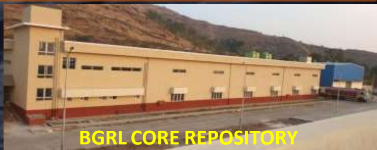
BGRL CORE REPOSITORY